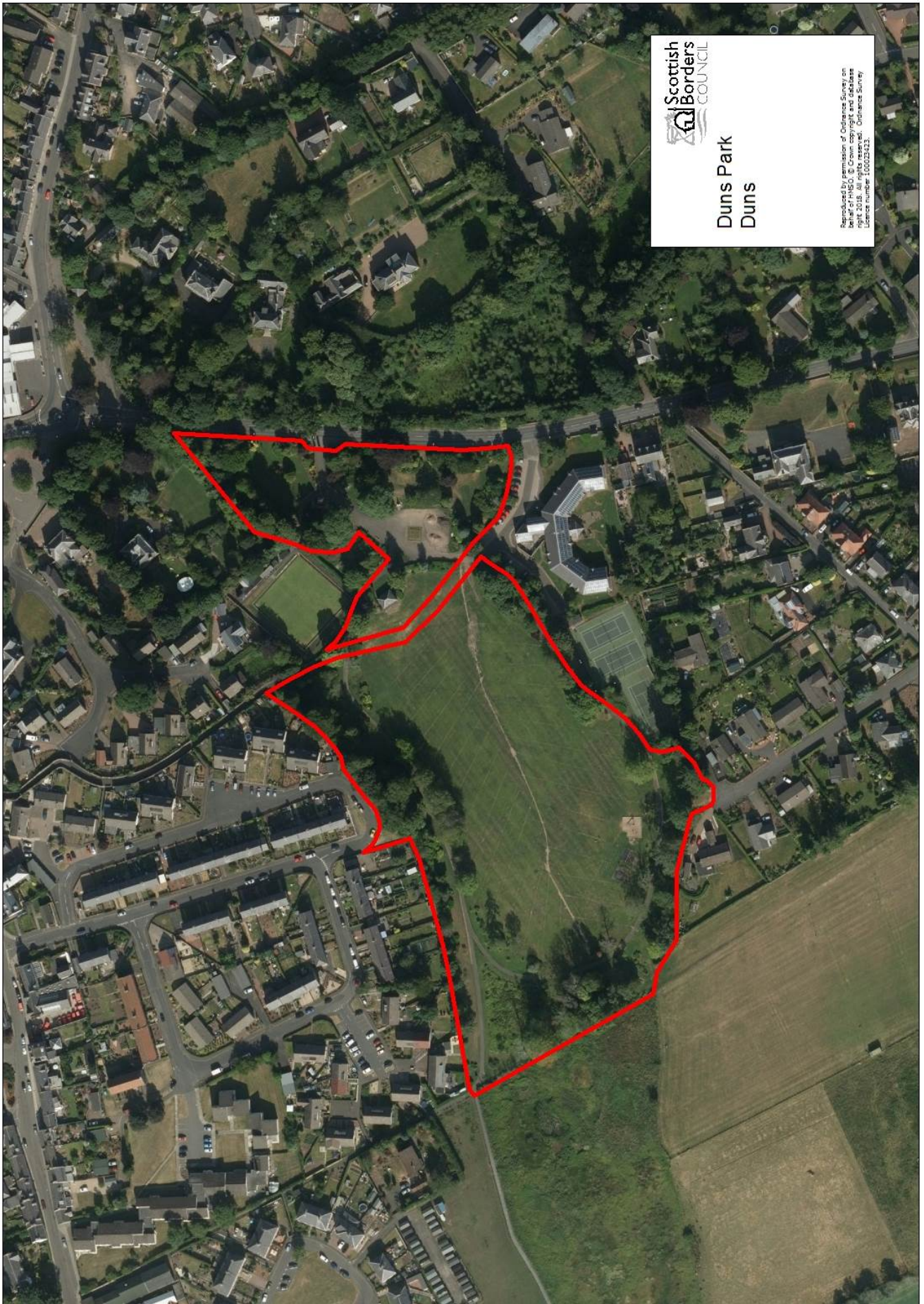
Appendix 1.3 –Duns Park, Duns