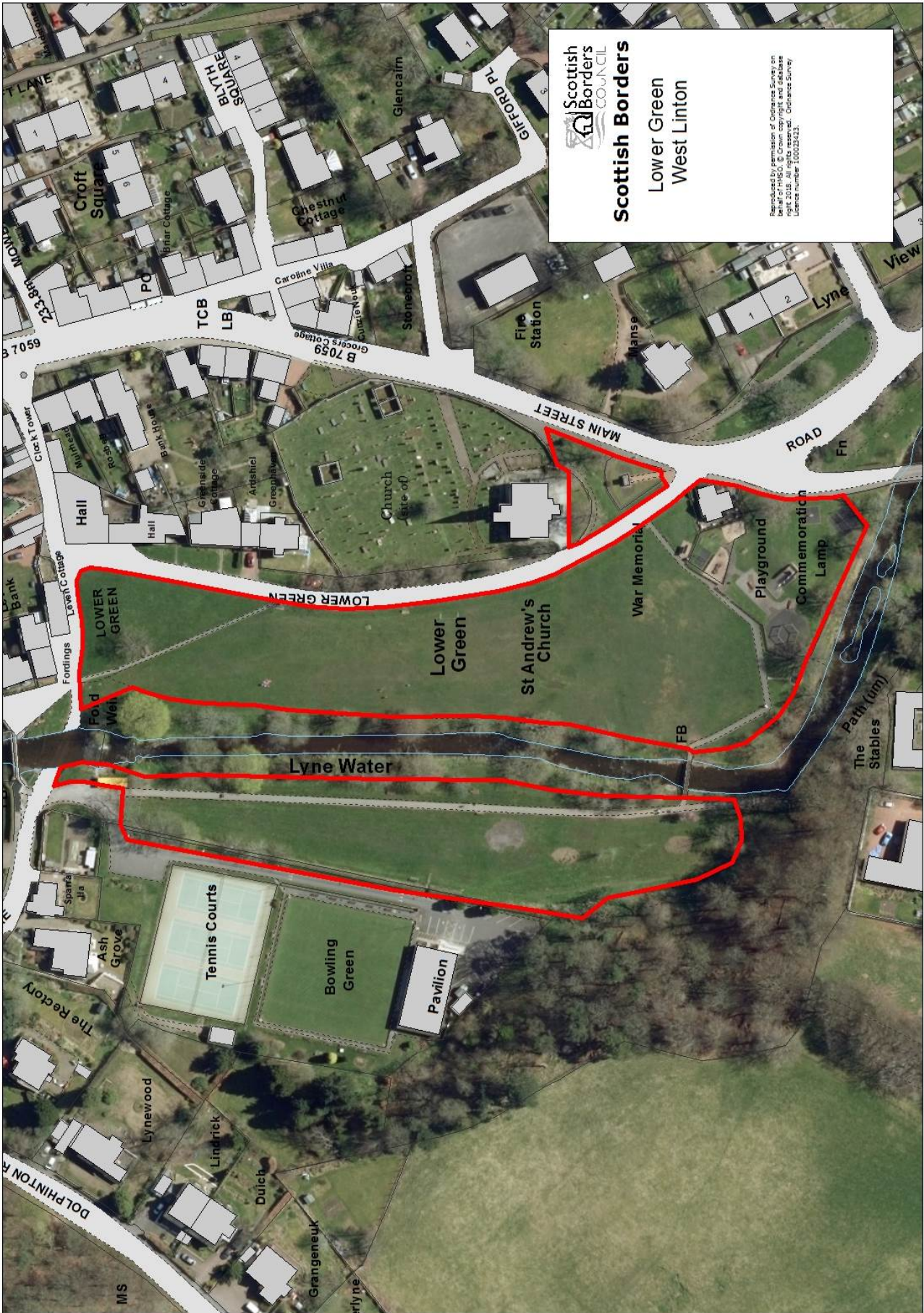
Appendix 1.2 – Lower Green, West Linton